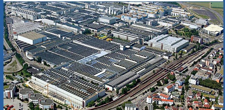
Factory tour Sindelfingen