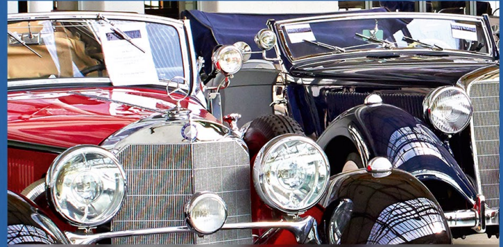
Visit the MOTORWORLD