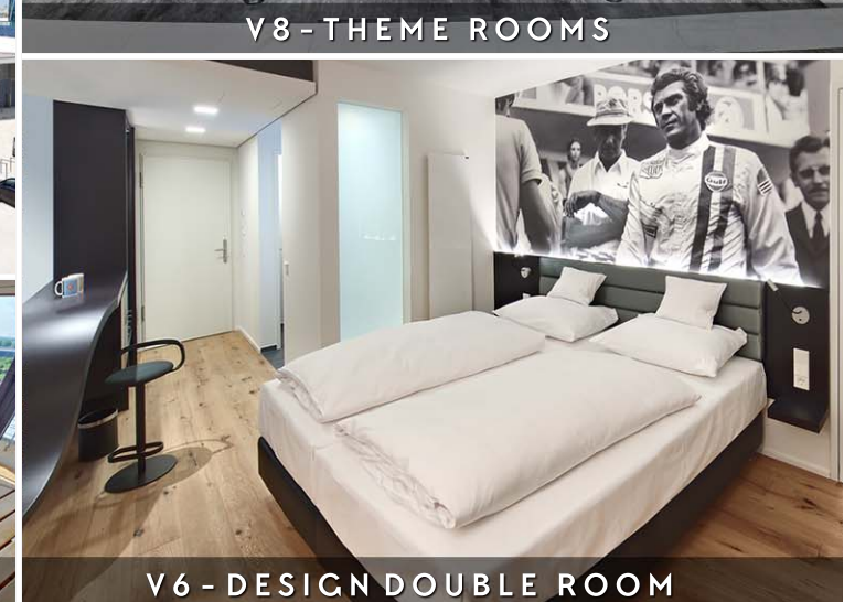
V6 - DESIGN DOUBLE ROOM