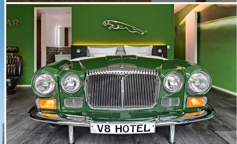
V8 - THEME ROOMS