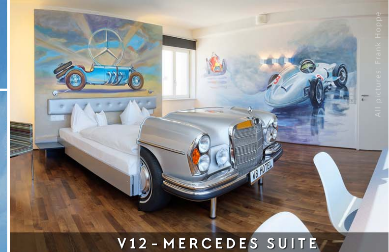
V12 - MERCEDES SUITE